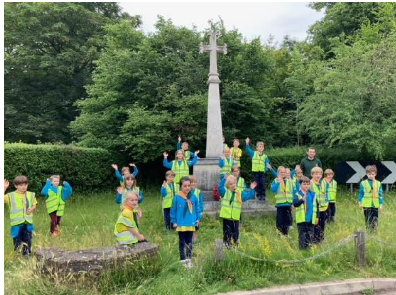
Tic Tac Winter Hill

We hope you all have a great summer and we look forward to seeing you in September.